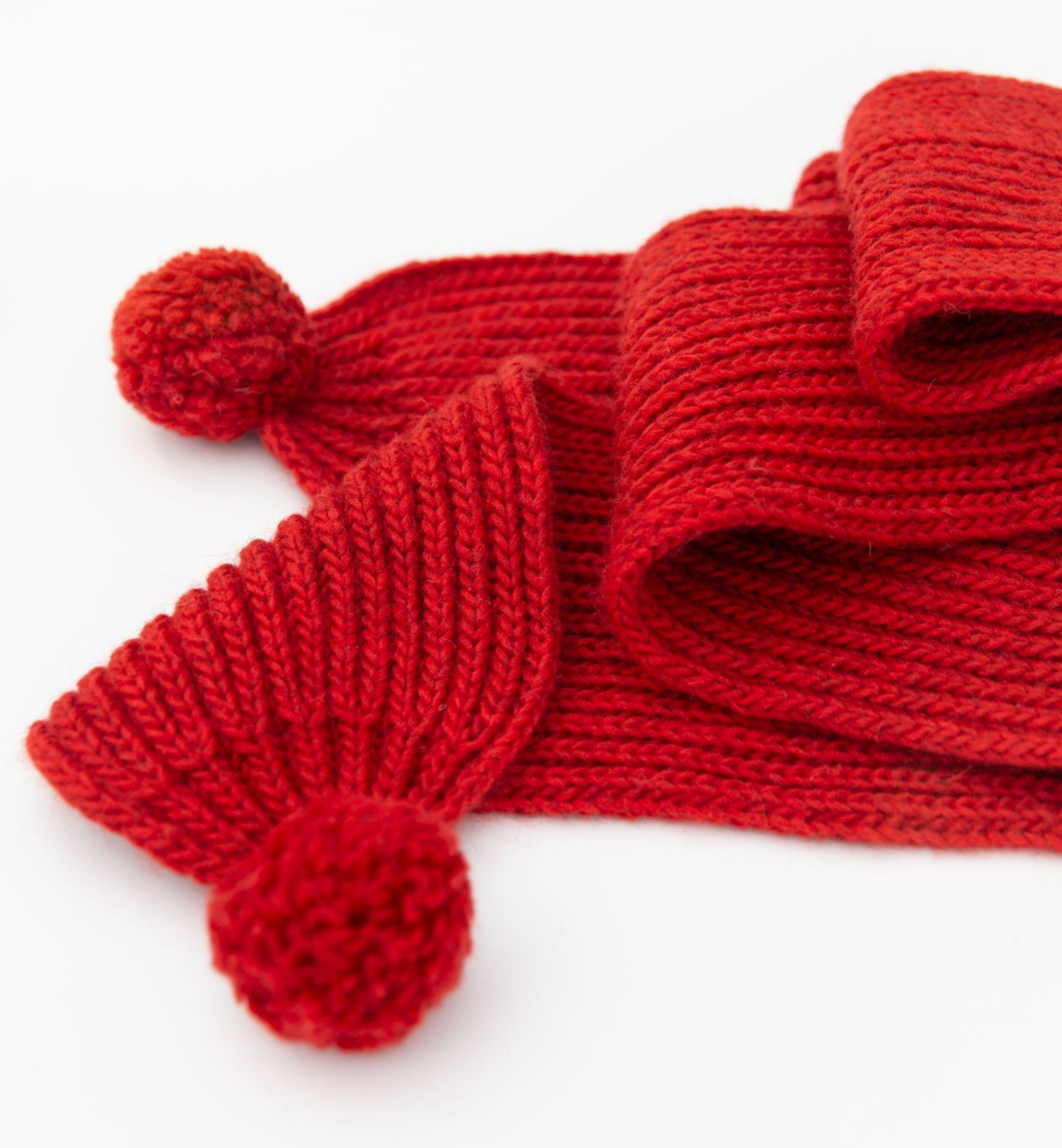
COPYRIGHT © PIA BOJER LARSEN // KAOS YARN 2022 Copy and commercial distribution of this pattern and knitwear made from it is prohibited.